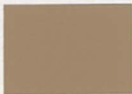
San Jose Buff CC715/1.5