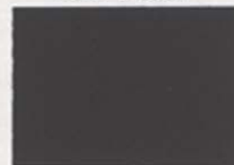
Dark Gray CC230/4